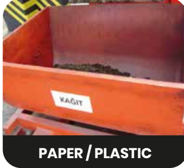
PAPER / PLASTIC

The contamination-free metals recovered from the process has scrap metal market value.