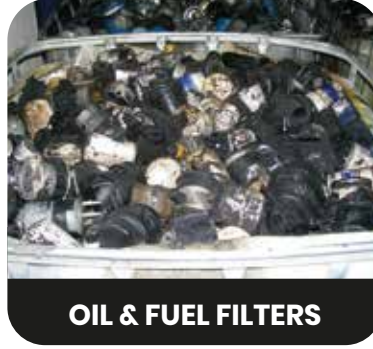
OIL & FUEL FILTERS